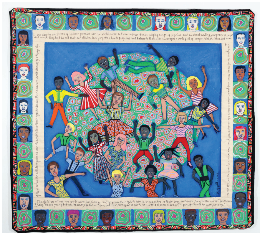
Faith Ringold's "Ancestor's Quilt"